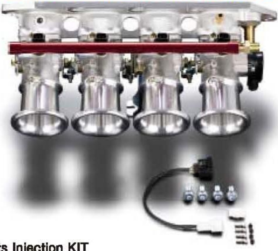
B18C Sports Injection KIT

An individual throttle for each cylinder. Gives super response, and improvements through out the rev range to both power and torque. ※The standard trumpet length is 63mm. ※Delivery pipe designed to be used with standard B16A injector nozzle size.