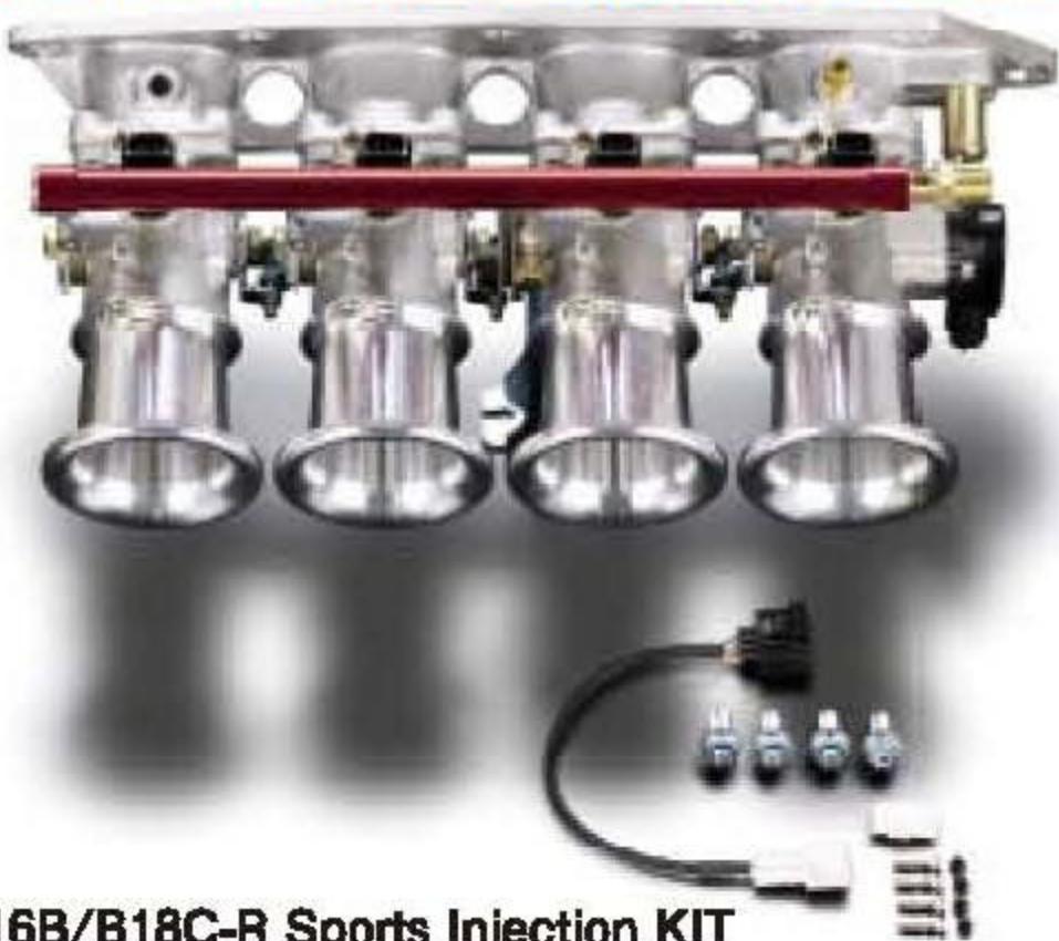
B16A/B16B/B18C-R Sports Injection KIT

An individual throttle for each cylinder. Gives super response, and improvements through out the rev range to both power and torque. ※The standard trumpet length is 63mm. ※Delivery pipe designed to be used with standard B16A injector nozzle size.