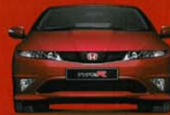
1785mm (2046mm including door mirrors)