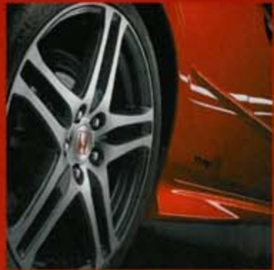
19" Alloy wheels - Race design