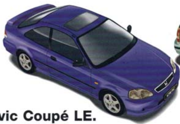
Civic Coupé LE. £13,995