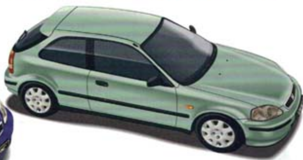
Civic 3 Door Initial. £9,995