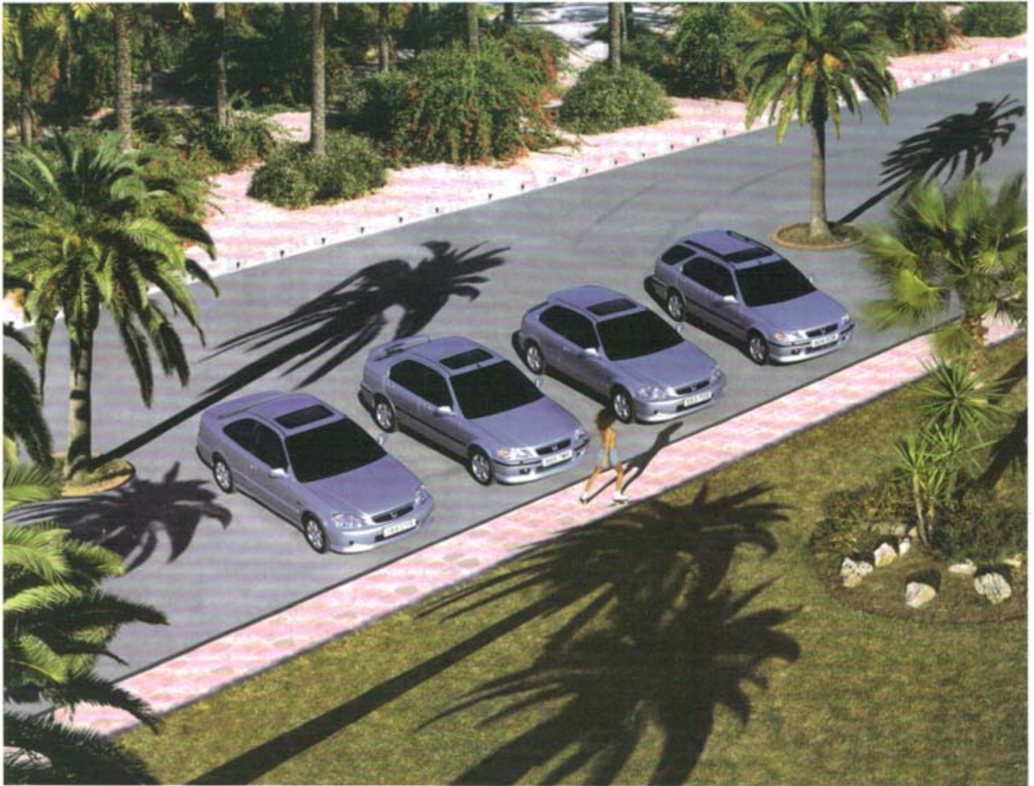
Cars featured are the Honda Civic Coupé VTI, Civic 5 Door VTI, Civic 3 Door VTI and the Civic Aero deck VTI.

St. Moritz inside the air-conditioned Civics.